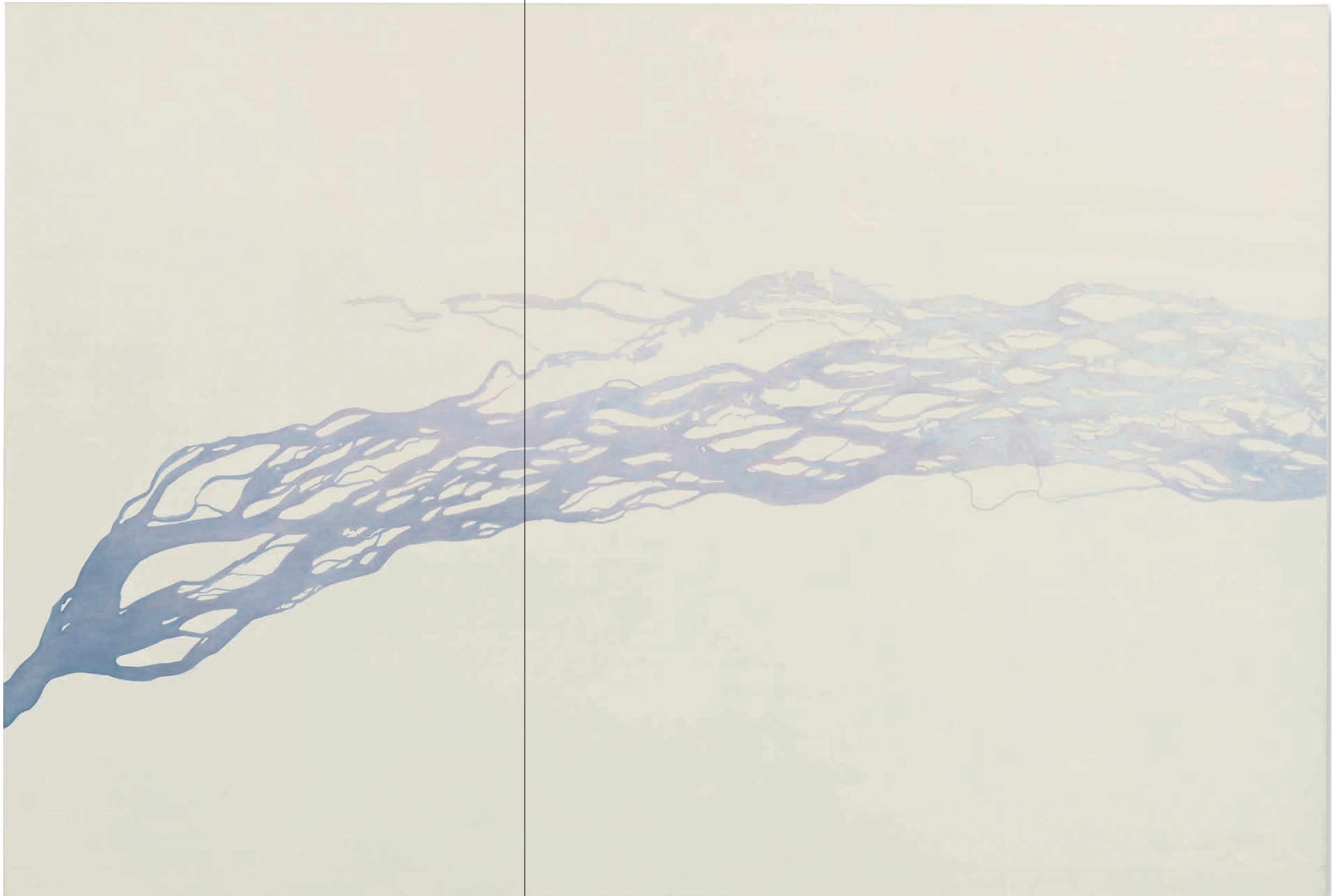
FIG. 4 Toba Khedoori, Untitled (Purple River) , 2011–2012 Oil on canvas, 36,6×53,8 in