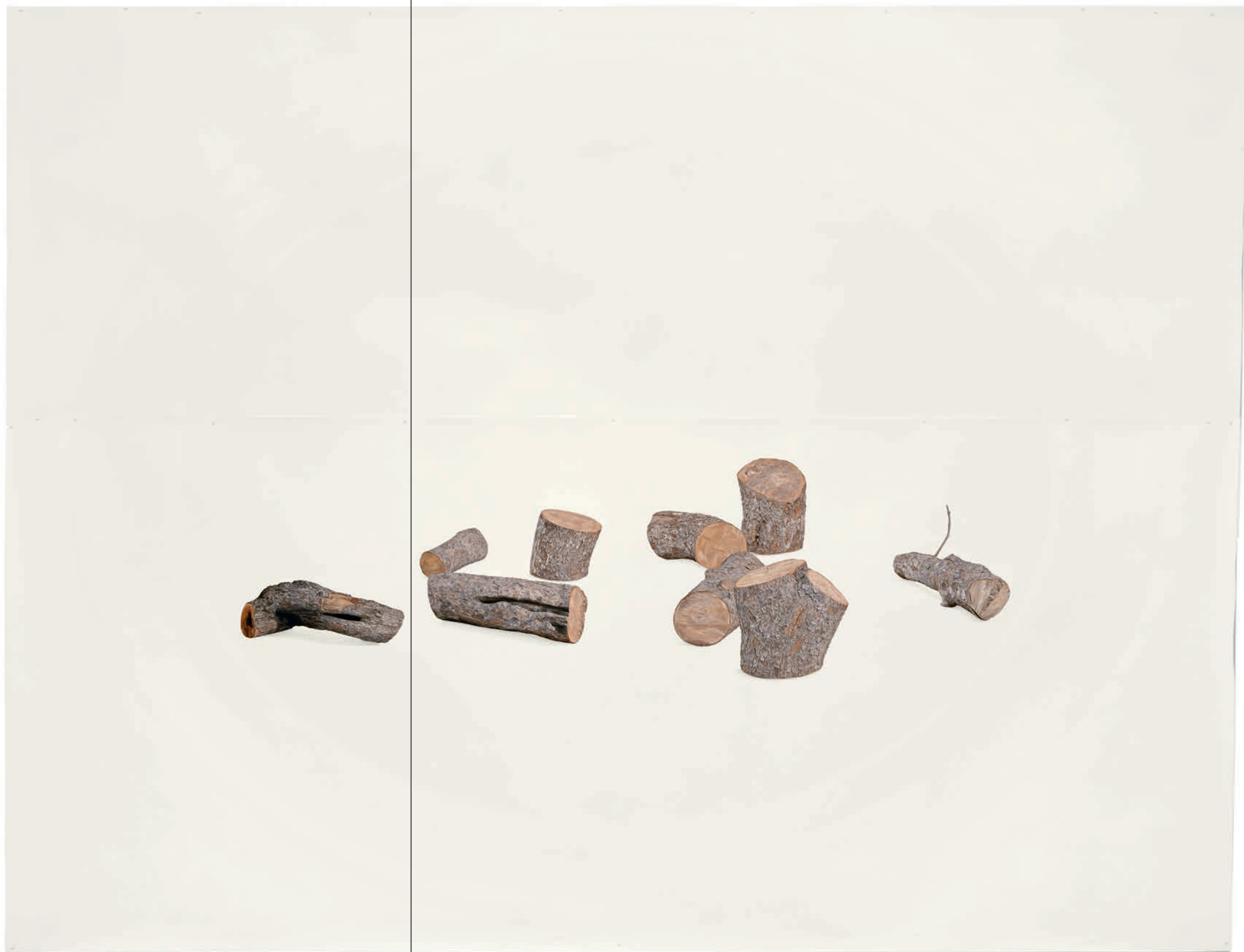
FIG. 3 Toba Khedoori, Untitled (Logs) , 2006 Oil and wax on paper, collage, 141,1×184 in