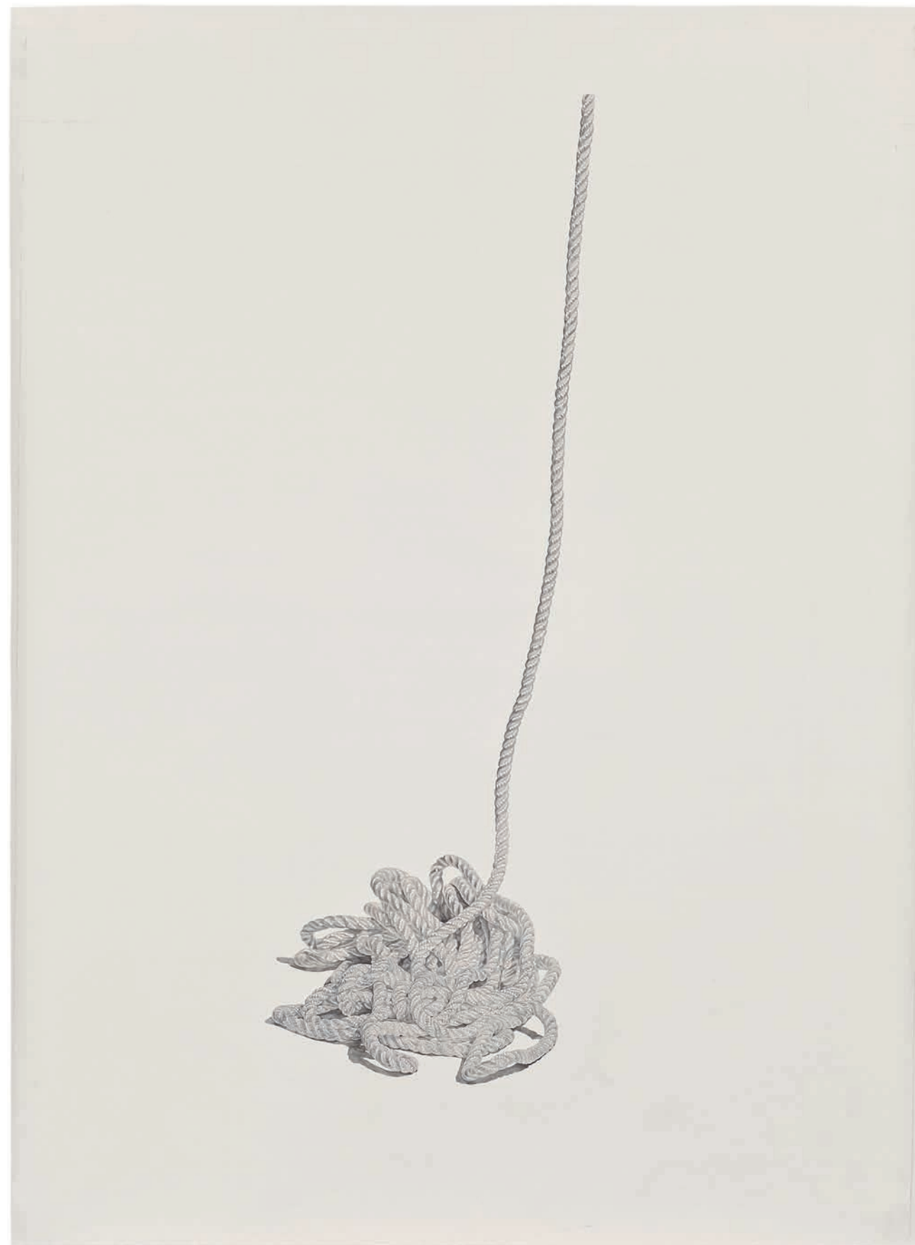
FIG. 5 Toba Khedoori, Untitled (Rope 2) , 2011 Oil on canvas, 37,1×23,3 in