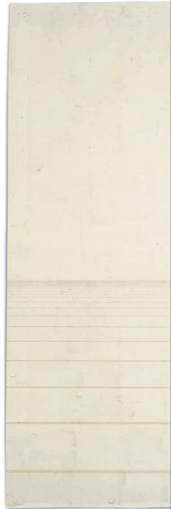
FIG. 1 Toba Khedoori, Untitled (Horizon) , 1999 Oil and wax on paper, 144,7 × 362,3 in