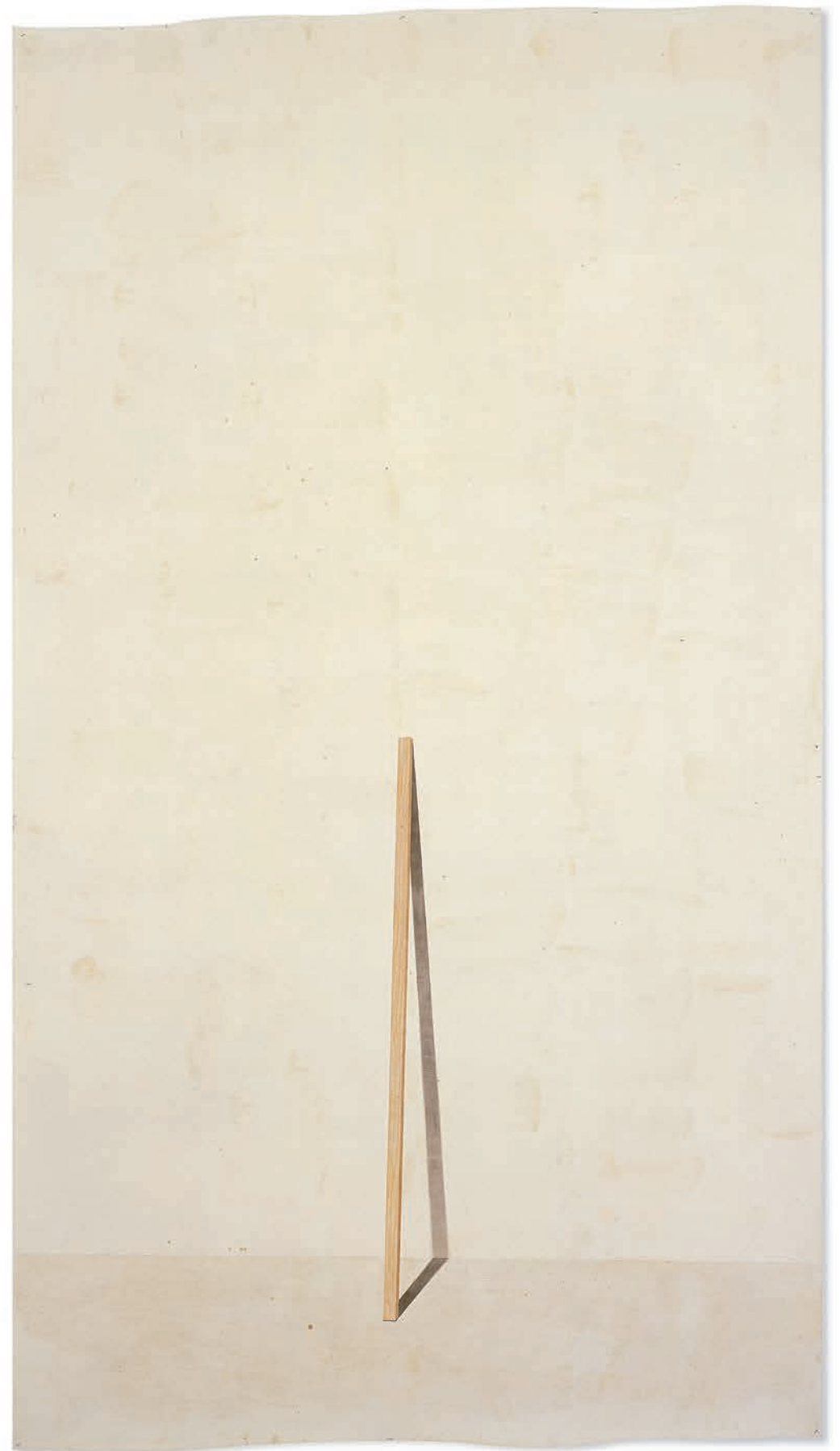
FIG. 2 Toba Khedoori, Untitled (Stick) , 2005 Oil and wax on paper, 142×80 in